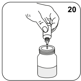
Add 20 drops Anionic/Polyamine Indicator P2/3.