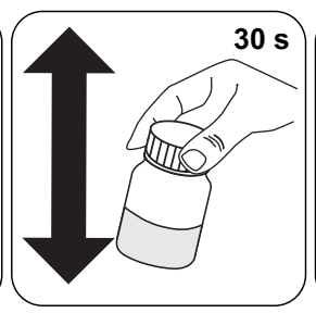
Mix the contents by shaking Open the jar. vigorously. (30 s).