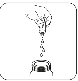
Attention! Record the number of drops that will be added. Note: Make sure to shake

Note: Make sure to shake the jar after adding each drop!