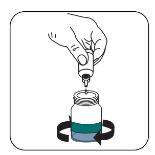
Add Polyamine Titrant P4/2 drop by drop to the sample until discolouration turns from blue to grey in the bottom layer (If P1/M layer is pink, the end point has been exceeded.).

Note: Make sure to shake the jar after adding each drop!