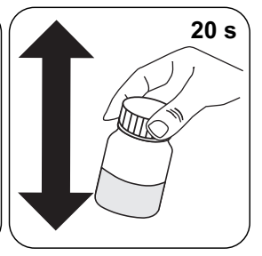
Mix the contents by shaking vigorously. (20 s).