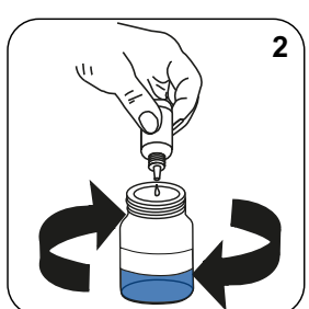
Add 2 drops Polyamine Titrant P4/2.