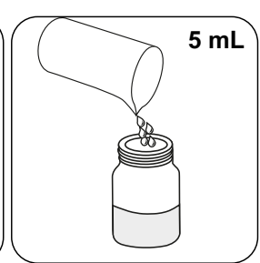
Add 5 mL Anionic/Polyamine Solvent P1/M .