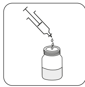
Attention! Select the appropriate sample volume based on results from standards (see notes).