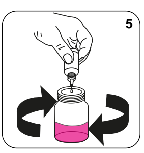
Add 5 drops of Acidity / Alkalinity P Indicator PA1 to give a pink colour.