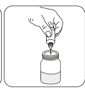
When using chlorinated products add 5 drops of Alkalinity Dechloration Reagent CL3 per 20 mL of sample.