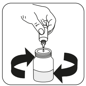
Add Alkalinity Reagent ALK3 or Alkalinity Reagent ALK4 drop by drop to the sample until discolouration turns from pink to colourless.

Note: Make sure to swirl the jar after adding each drop!