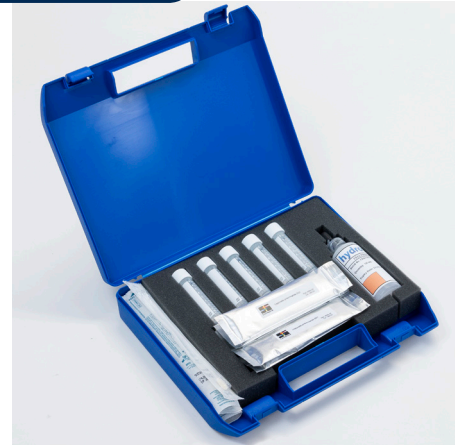
Swab Legionella Field Test™ Kit product code 56B006401

*The Centers for Disease Control and Prevention (CDC) is a federal agency that conducts and supports health promotion, prevention and preparedness activities in the United States, with the aim of improving overall public health.