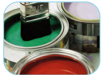
Coatings and Inks