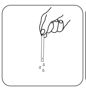
Shake off excess liquid.