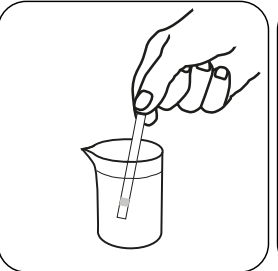
Remove one test strip. Hold Dip the test strip into the solution to be tested so that the pad is completely immersed.